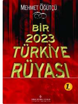
Bir 2023 Türkiye Rüyası Mehmet Öğütçü