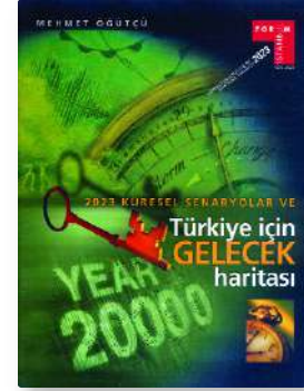
2023 Küresel Senaryolar ve Türkiye için Gelecek Haritası Mehmet Öğütçü