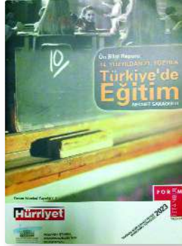
Türkiye'nin Eğitim Raporu Necdet Sakaçoğlu